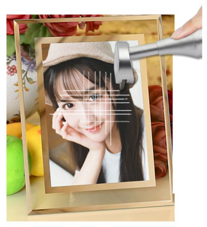
Hand wipe non-trace

QFH Cross Cut Tester, can't be scratched off