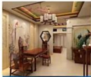
Building materials Industry