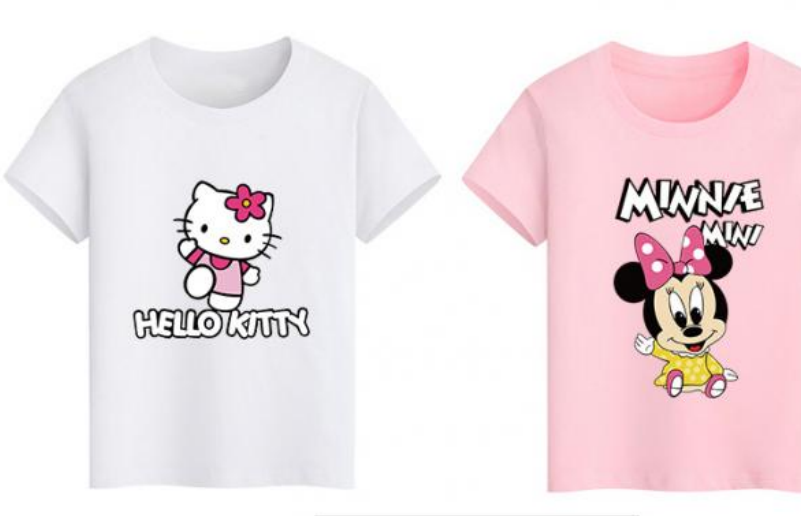
Cotton printing pattern