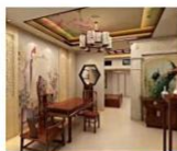
Building materials Industry